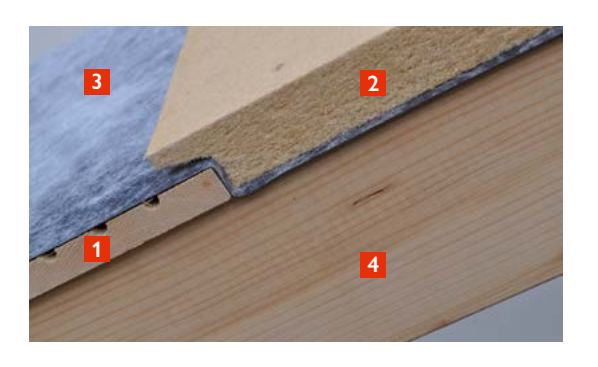
Eaves 1. Variant