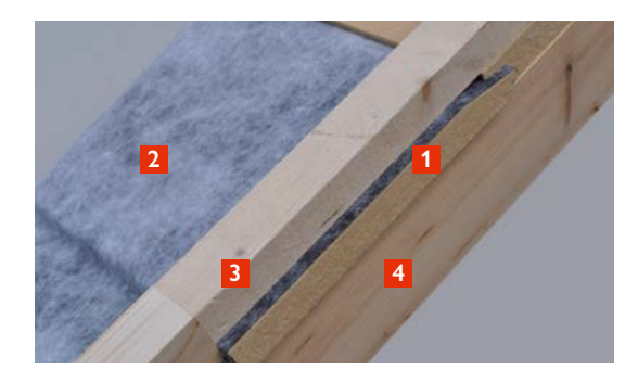
Eaves 2. Variant